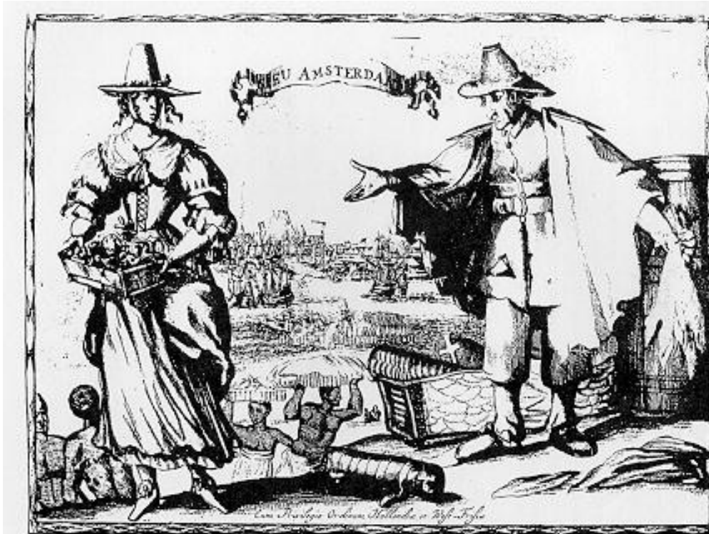
Figure 1. "Neu Amsterdam" is the first detailed print depicting Dutch New York, circa 1642. (From I. N. Phelps Stokes, The Iconography of Manhattan Island , Volume 1, plate 5, Robert H. Dodd, 1916.)

Source: Sherrill Wilson (1994). New York City's African Slaveowners . NY: Garland.