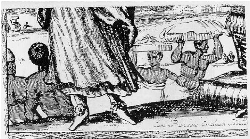
Figure 2. Enlarged detail of "Neu Amsterdam" depicts enslaved African woman and man working together, carrying baskets on their heads. (From I. N. Phelps Stokes, The Iconography of Manhattan Island , Robert H. Dodd, 1916).