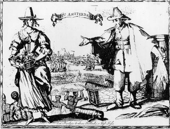
Figure 1. "Neu Amsterdam" is the first detailed print depicting Dutch New York, circa 1642. (From I. N. Phelps Stokes, The Iconography of Manhattan Island , Volume 1, plate 5, Robert H. Dodd, 1916.)

The New York African American Burial Ground sponsors an annual writing competition for students. The theme for the contest is the African presence in colonial New York City. Poems should be 150 words or less. Use these pictures to help you write your poem. It is okay to be angry about what you see in the images. To learn more about the contest, contact its sponsors at: