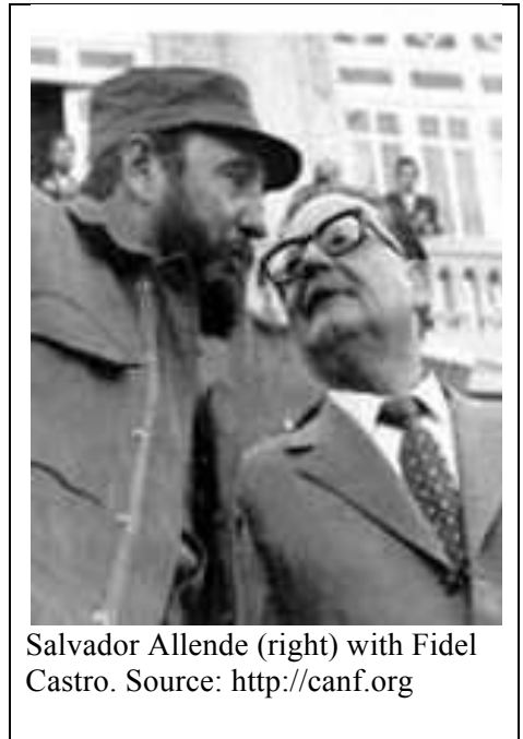
Salvador Allende (right) with Fidel Castro.

On September 11, 1973, a military coup under the leadership of Chilean General Augusto Pinochet overthrew Allende and established a military regime or junta in Chile. While fighting to defend his government, Allende was killed. In the weeks that followed, an estimated 3,000 supporters of Allende were either murdered or disappeared.