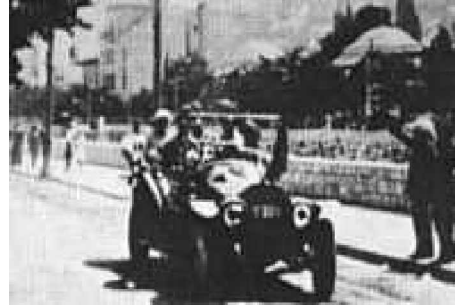
June 28, 1914 - Assassination in Sarajevo

9. What happened on June 28, 1914 in Sarajevo, Bosnia?