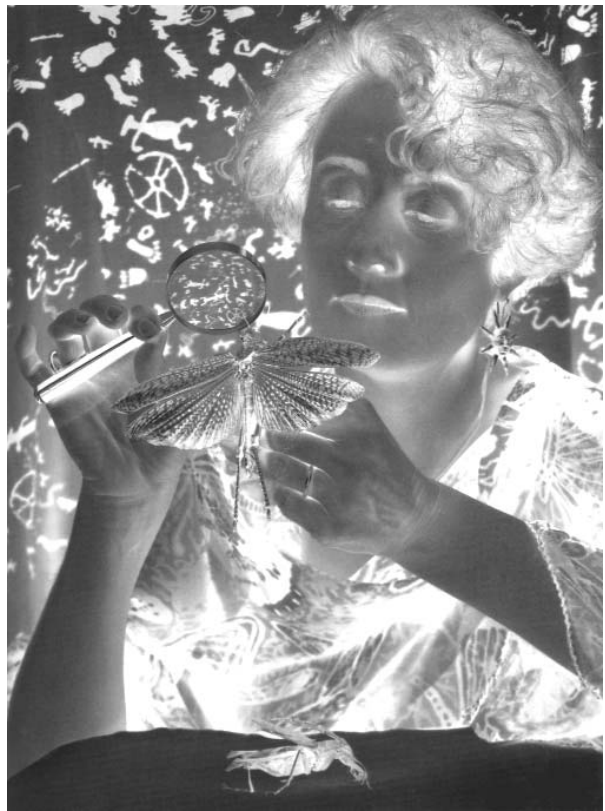
Dark Sun #18

For the viewing device the woman holds off to the left, Jaffe bought one with a black handle, “so it would be white and glow in her hand.” The resulting composition is static, and yet alive with motion, from the fluidity of the drape of the woman’s blouse to the figures falling through space on the walls. Precisely chosen, positioned,