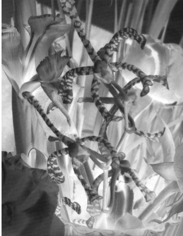
Dark Sun #9 (1990)